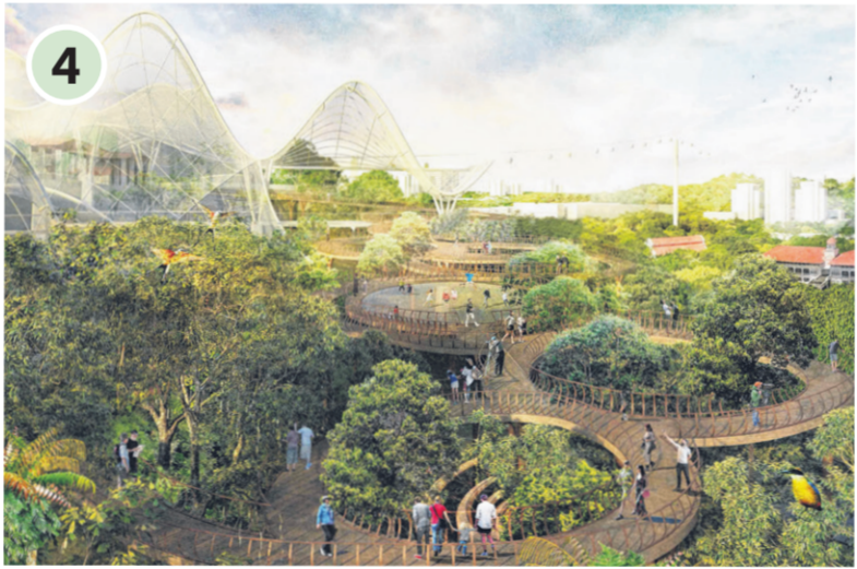
Expanded nature and heritage trails and attractions.