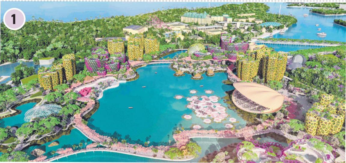
New attractions will sit alongside Resorts World Sentosa.