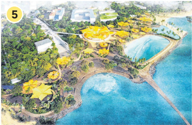
Sentosa's revitalised beaches will be connected to the mainland.