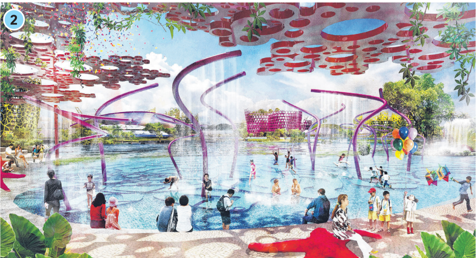
Indoor and outdoor activity spaces in the heart of the island.