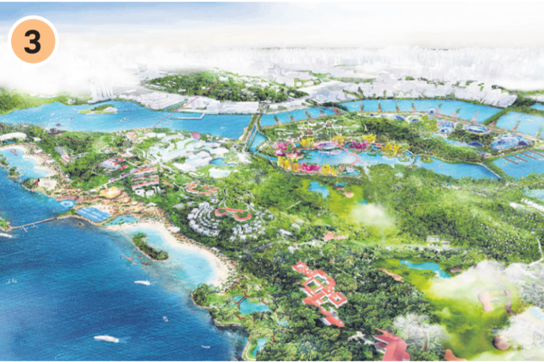
Pulau Brani will house a "futuristic" Discovery Park.