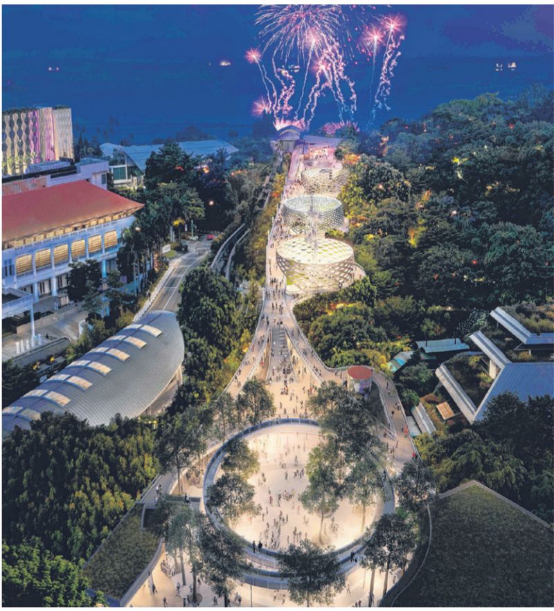
Bird's eye view of Sentosa Sensoryscape.